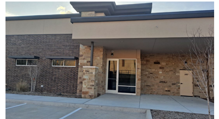
Private Side Entrance