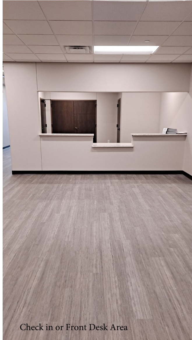
Check in or Front Desk Area