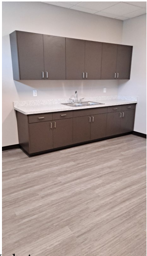
Breakroom or Lab Area