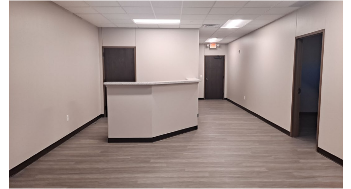
Potential Nurse's Station